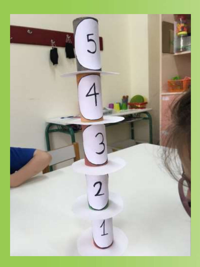
.... with toilet paper rolls