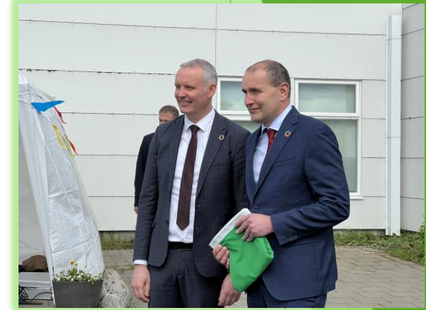
The Icelandic President and the Mayor