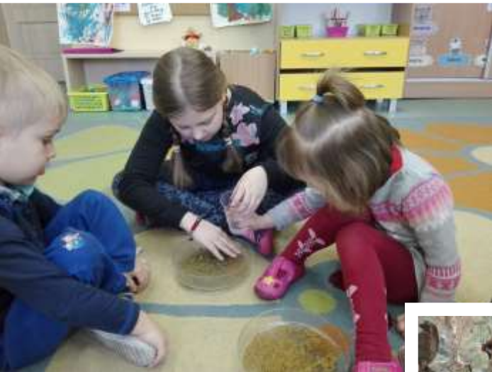
Sowing mung bean sprouts, alfalfa